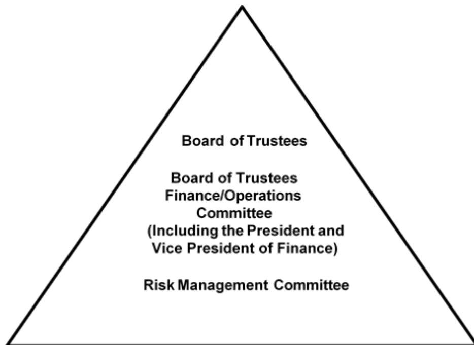
Figure 3.2: Risk Management Organization

The President, Vice President of Finance, and other designated administrators should oversee, coordinate, and assign responsibilities for implementing this Risk Management Program, and should report to the Board of Trustees through the Board Finance and Operations Committee. The Risk Management Committee should perform the Risk Management Process, and report to the Vice President of Finance. Figure 3.2 illustrates the risk management organization.